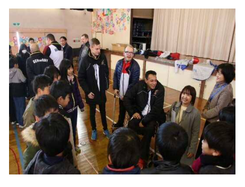
▲Answering questions from students