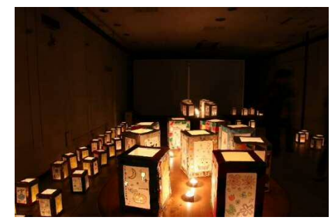
▲Lanterns made by Students (On display in Sankt Martin)