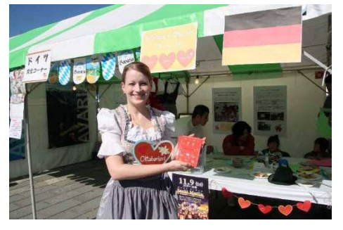
▲German Culture Corner at the Coalmine Festival