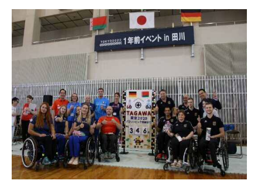
▲One-year-ago Event in Tagawa