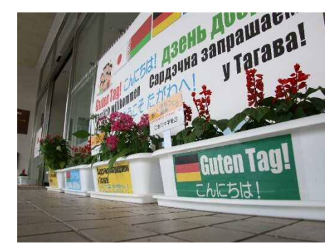
▲ Flowers Grown by Local Students